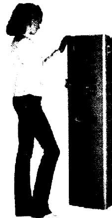
Smaller Alternative preferred 1.59m high max